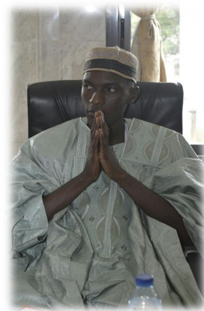
HELP COMMUNITY president