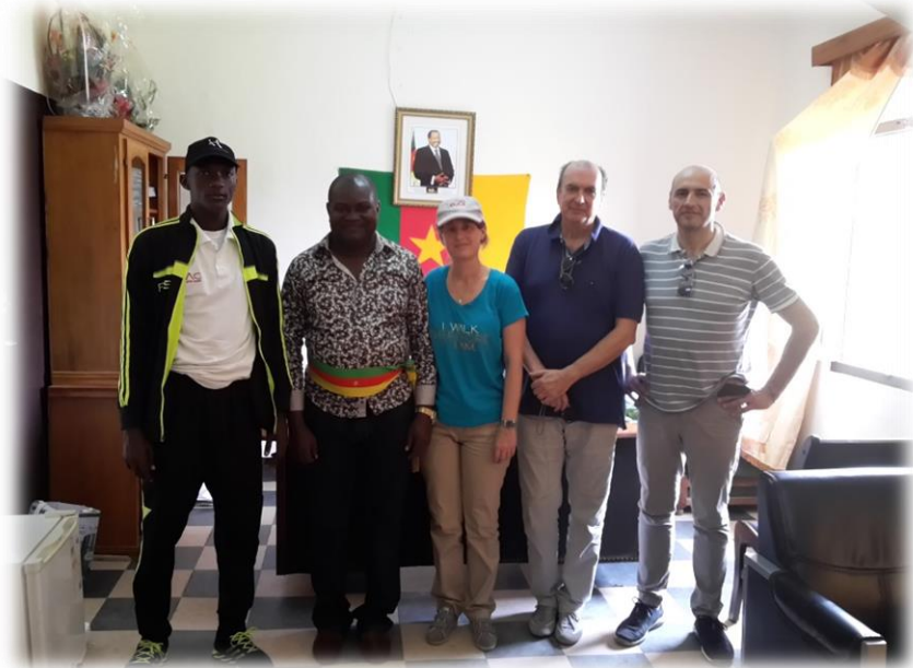
Major of Matomb & Partners