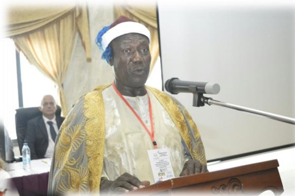
One of the senators